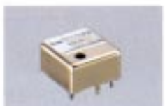
CR-293 HIGH STABILITY CRYSTAL UNIT Frequency stability: ±0.5 ppm at 0°C to +60°C