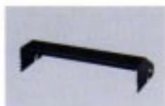
IC-MB12 MOBILE MOUNTING BRACKET Receiver mounting bracket for mobile operation.