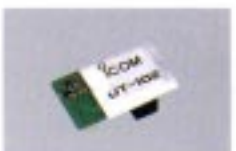
UT-102 VOICE SYNTHESIZER UNIT Provides audible confirmation of an accessed band's frequency.