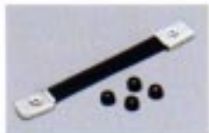
MB-23 CARRYING HANDLE For easy portable operation.