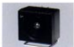
SP-7 EXTERNAL SPEAKER Input impedance: 8 Ω Max. input power: 5 W