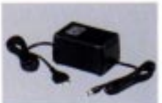
AD-55/A/V AC ADAPTER Allows you to power the receiver via domestic AC.

Icom Inc. 6-9-16, Kamihigashi, Hirano-ku, Osaka 547, Japan Phone: 06 793 5302 Fax: 06 793 0013