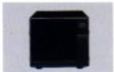
SP-21 EXTERNAL SPEAKER Input impedance: 8 Ω Max. input power: 5 W