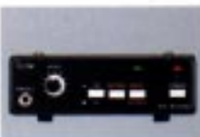
TV-R7100 TV/FM ADAPTER For TV broadcast reception and FM stereo reception.