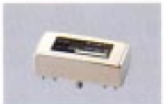
FL-52A CW NARROW FILTER Center freq.: 455 kHz Bandwidth: 500 Hz/-6 dB